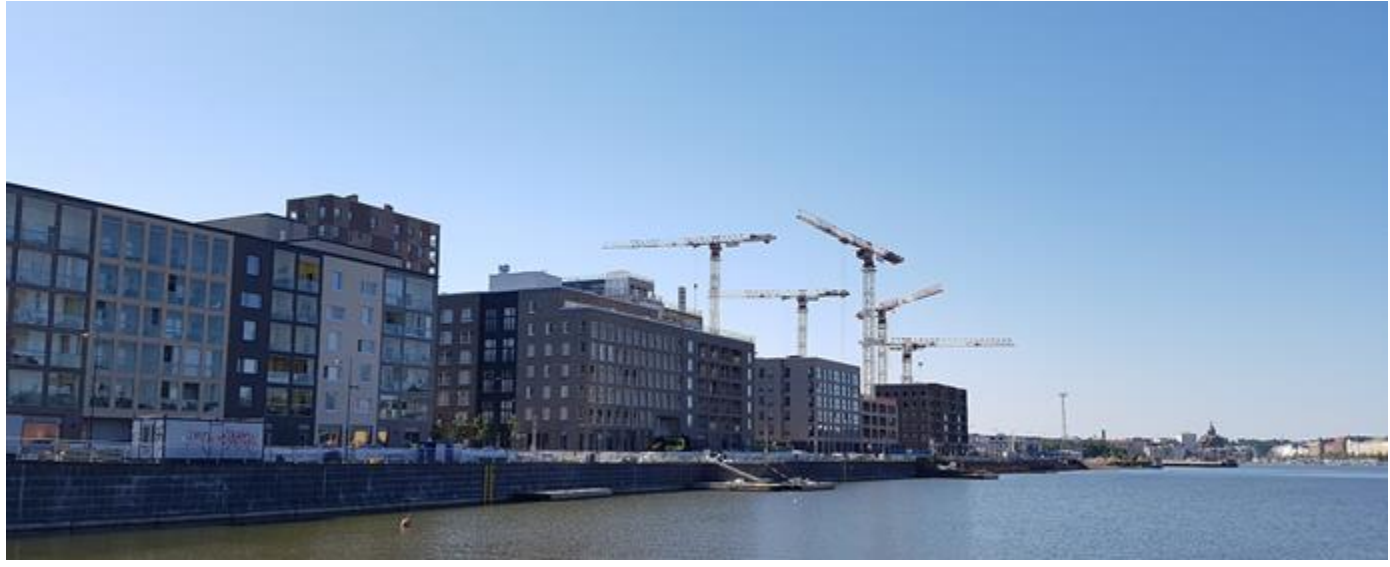
The SunZEB building of Asuntosäätiö is the second building from the right in Kalasatama's Sompasaari.

The first SunZEB building by Asuntosäätiö was finalized in April 2020. The architectural solutions used in the block of SunZEB houses of Kalasatama are modern and light.